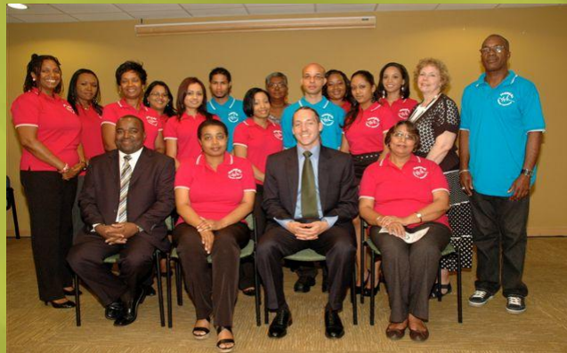
The Medical Library Network Team with EBSCO personnel

The Minister's speech at Launch http://youtu.be/LmII0XPiHR8